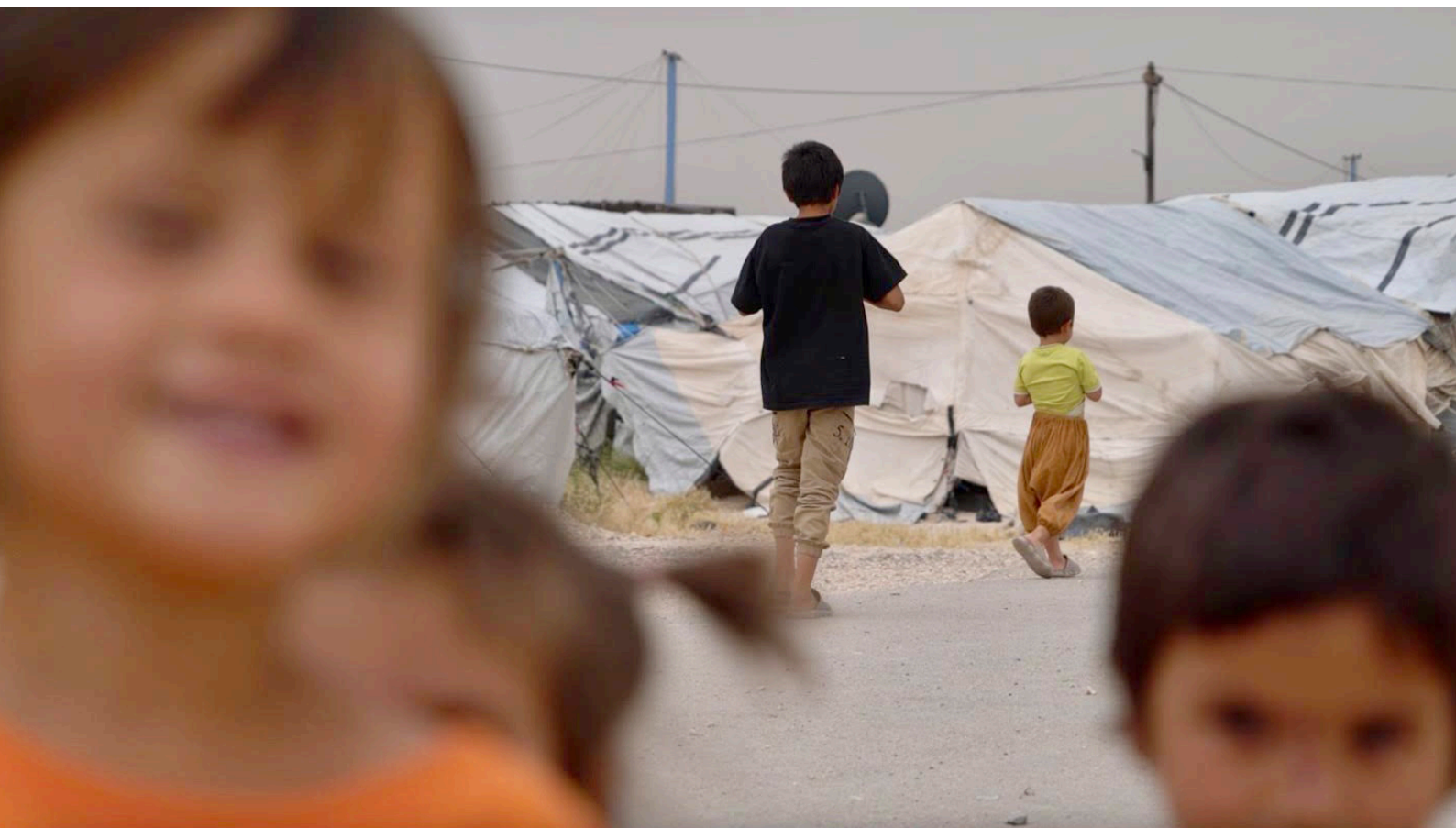
Children in Roj Camp, NES

repatriated, or otherwise helped bring home, citizens (however, most countries that have repatriated have only brought a few of their citizens back 14 ), showing that it is possible and that the window for repatriation has been open for more than two years already. Fionnuala Ni Aolain, the UN Special Rapporteur on the Promotion and Protection of Human Rights and Fundamental Freedoms while Countering Terrorism 15 , confirms that all these 57 states, including Sweden, are in a position to return their nationals 16 .