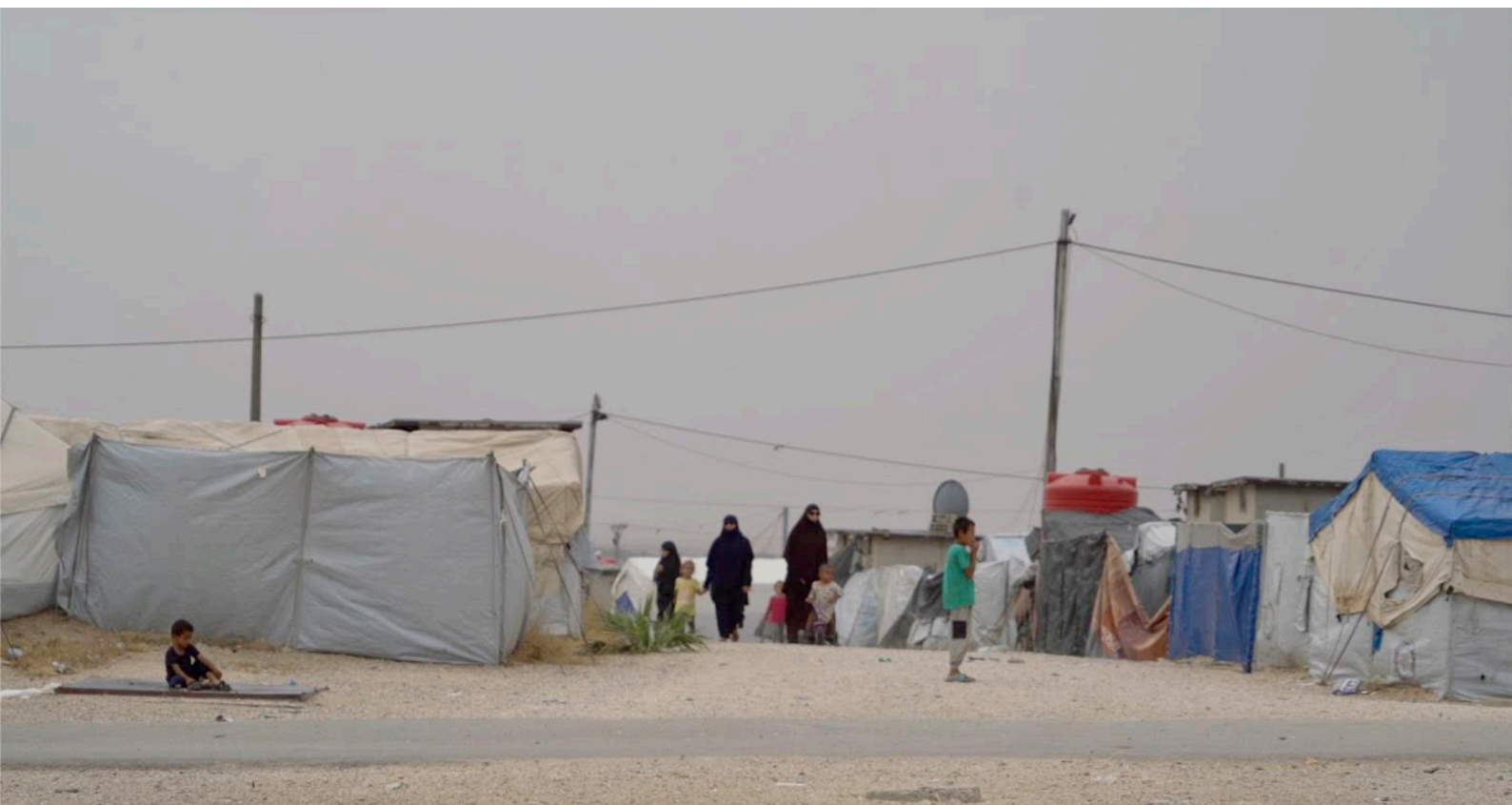
Children and women in Roj Camp, NES

In Roj camp, the living conditions are considered better than al-Hol, yet it is a crowded, tented camp with approximately 2,600 detainees 51 . The area is surrounded by barbed wire fencing, and armed soldiers monitor from watchtowers to discourage attempts at escape. The day in May the RTC Sweden delegation visited Roj, it was over 40 Celcius degrees. During the visit, a sudden sandstorm struck, destroying several tents. This instance provided a small understanding of the weather conditions faced by camp residents. The overall situation in the camp appeared chaotic and the delegation was only given a short time to visit the camp. The delegation was not able to meet with any Swedish children, but did meet one of the twelve Swedish women detained there, Amina. Amina was detained by SDF and first brought to the al-Hol camp, but was transferred along with her children to Roj camp during the summer of 2020.