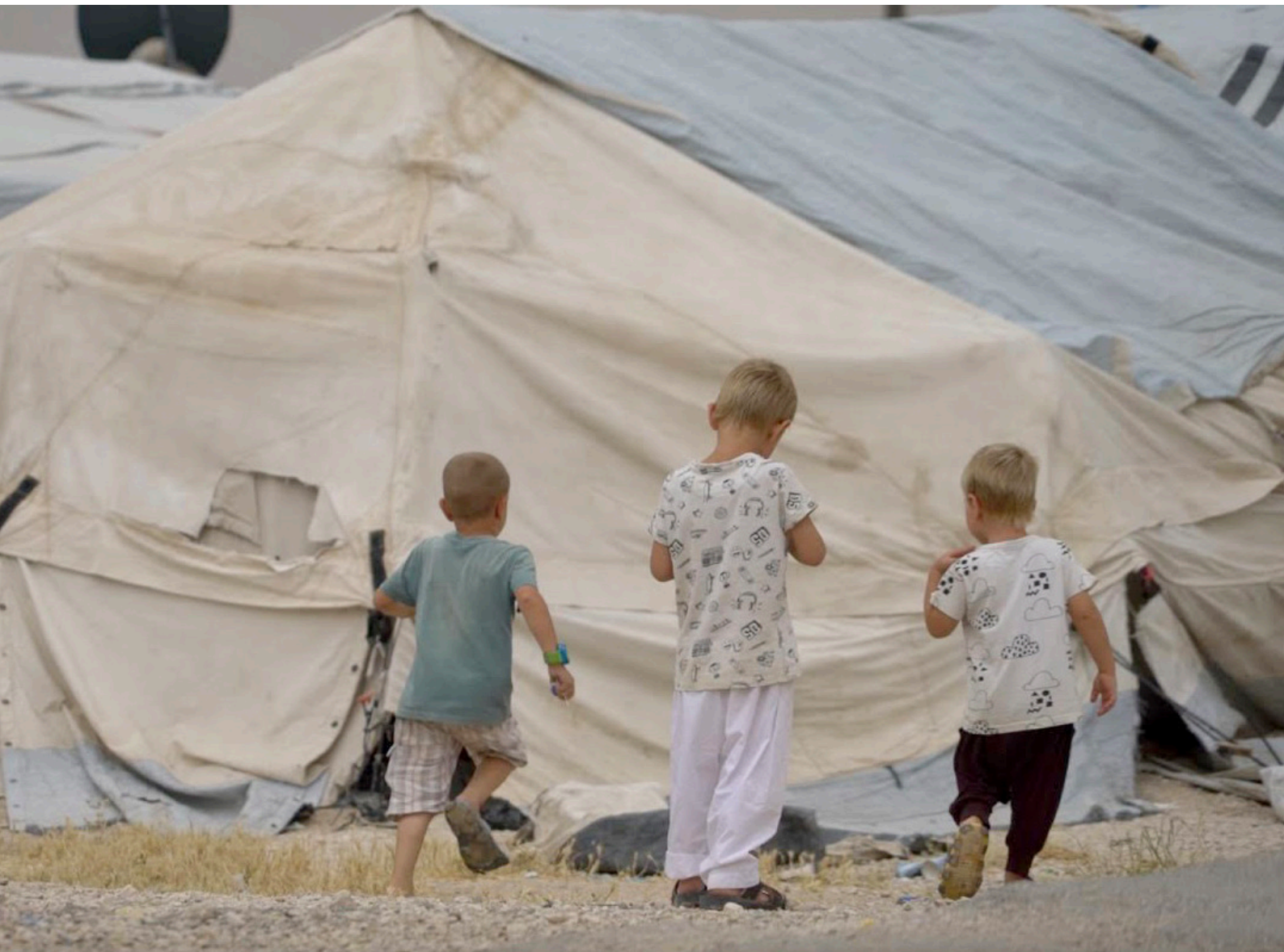
Children in Roj Camp, NES

families - in Syria, Iraq and elsewhere - from being victims of war.