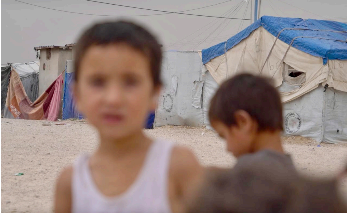
Children in Roj Camp, NES

There are many civil society organisations advocating to the 57 governments with citizens in detention in NES not to lower the bar for children's rights by making exceptions from conventions that have been ratified. In a Human Rights Watch appeal from May 2021, it is stated: